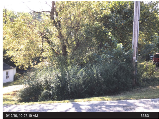
9/12/19, 10:27:19 AM 8383 (http://images.vgsi.com/photos/SalemVAPhotos//0016\8383_8383_1_1.JPG)