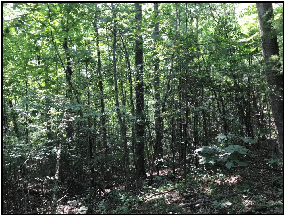
Photos 1 and 2: Examples of forest cover from the Wilson Tract—dense stands of approximately 20 year-old yellow poplar and oak species.