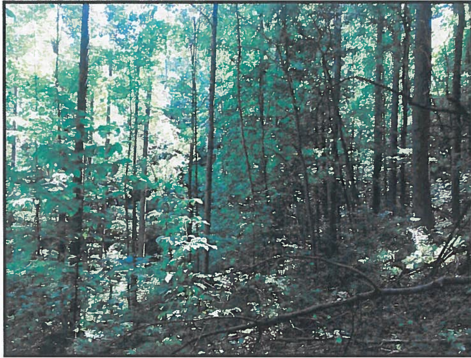
Photo 3: A growing forest—a mix of poles and small- and medium-sized sawtimber trees.